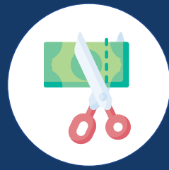
Reduction in hours or pay