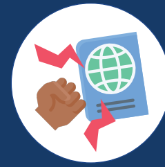
Threats related to immigration status