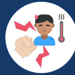
Discipline, including for using paid sick leave

In California, if you feel your workplace rights are violated and you take action or speak up, your employer cannot punish you for exercising your rights. This is called retaliation and it is illegal!