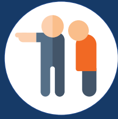
Termination, demotion, or suspension

These are a few examples of what retaliation can look like: